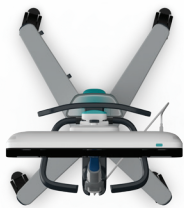
Shorter legs at the front